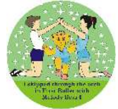
Sample ballet stickers