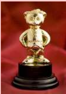
First Ballet with Melody Bear Award

First Ballet Classes that run as part of school clubs are invoiced at £6 per class, payable half-termly (usually 6 weeks). This is an all inclusive fee covering all costs associated with the programme except uniform (which costs approx £25 for a dress, socks and shoes) and the final assessment.